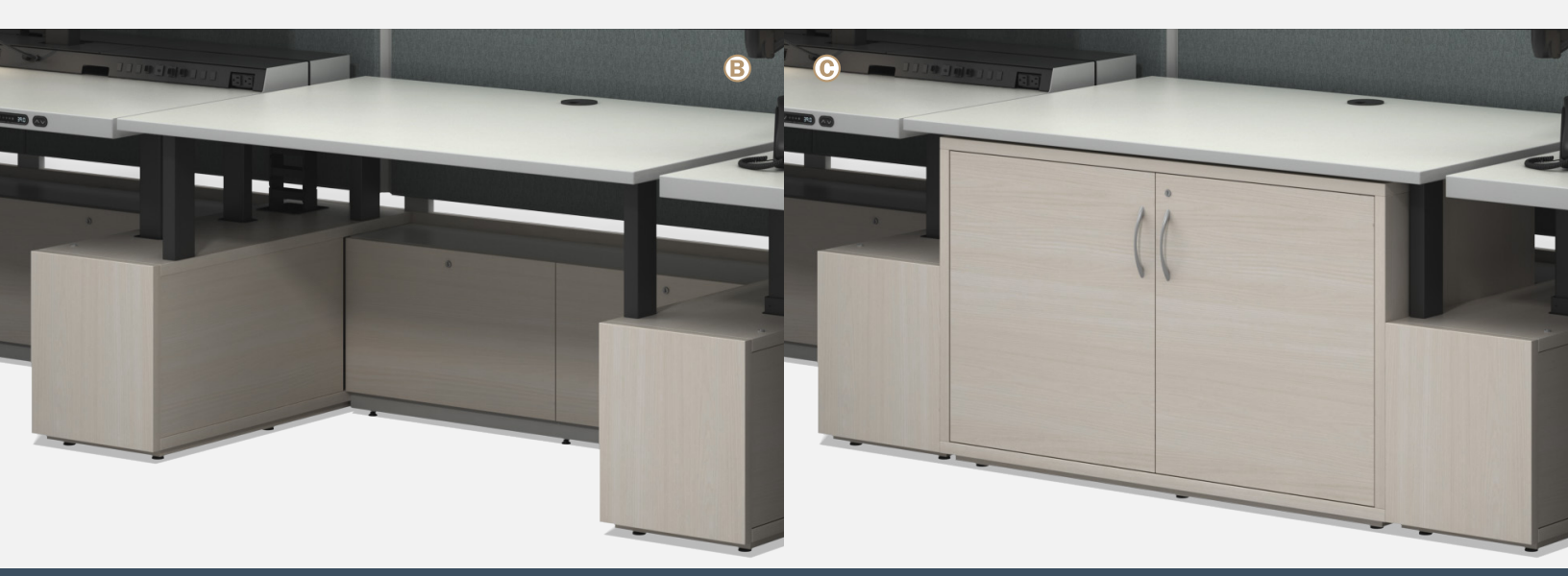
Table spanner styles are available in 39" or 51" depths, with pop up power.

26246 Twelve Trees Lane NW, Poulsbo, WA 98370 tel 360.394.1300 watsonconsoles.com