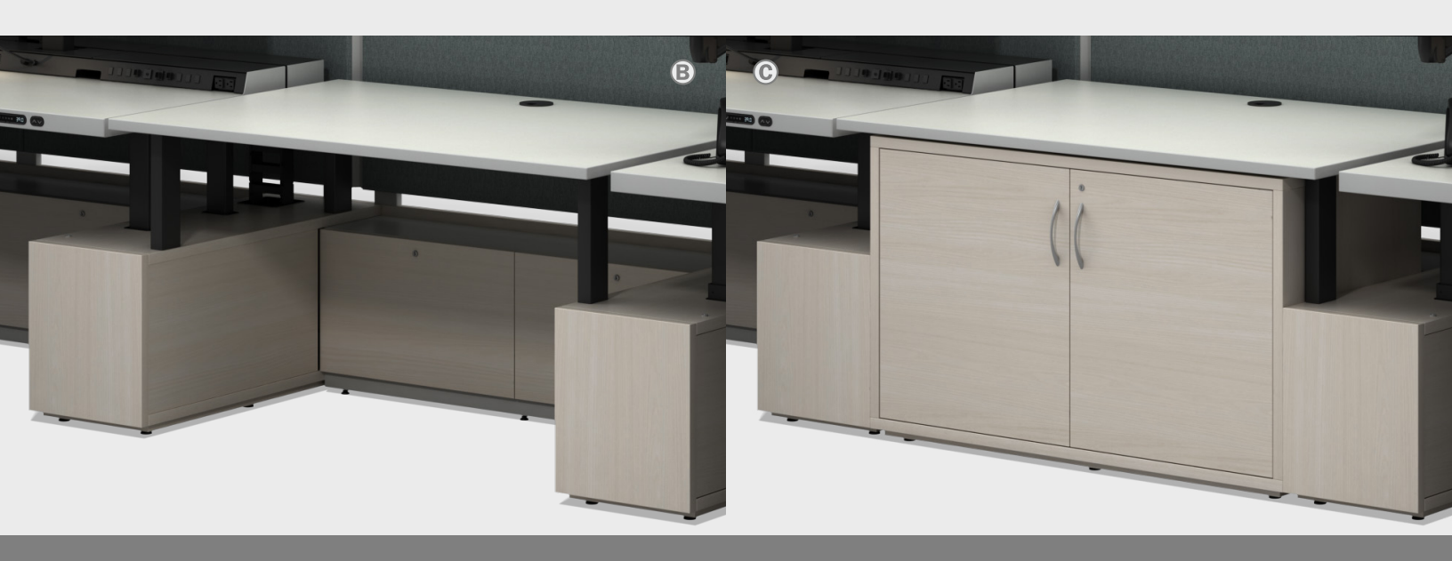
Table spanner styles are available in 39" or 51" depths, with pop up power.

26246 Twelve Trees Lane NW, Poulsbo, WA 98370 watsonconsoles